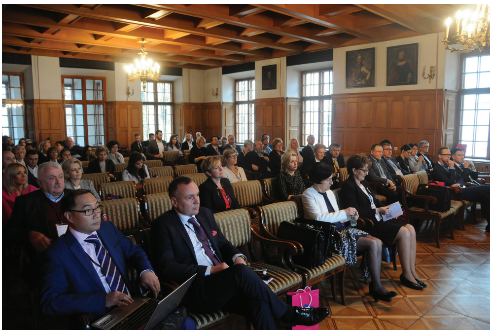
Lecture hall with conference participants